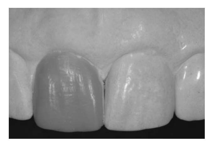
Figure 3. A frontal view of the diagnostic wax-up. Note the reproduction in wax of the surface texture and contours of the adjacent maxillary incisor.