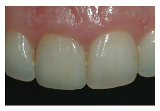
Figure 9. A frontal view of the completed restoration in the patient's mouth 2 years after cementation.

Evaluating cervical contours and the presence of a recession will affect the prospective integration of the restorations with the supporting tissues as well as with the adjacent tooth using the fabrication of a cementoenamel junction and mimicking the root or the use of surgical root coverage. Variations in shape and proportions, crowding, rotations, and diastemata must all be discussed with the patient and taken into account by the dental ceramist while fabricating the restoration. Many times, because of the complexity of the tooth to be matched, the best possible solution is to have the ceramist see the patient and to actively participate in the restoration matching process while also fabricating custom shade tabs as needed.