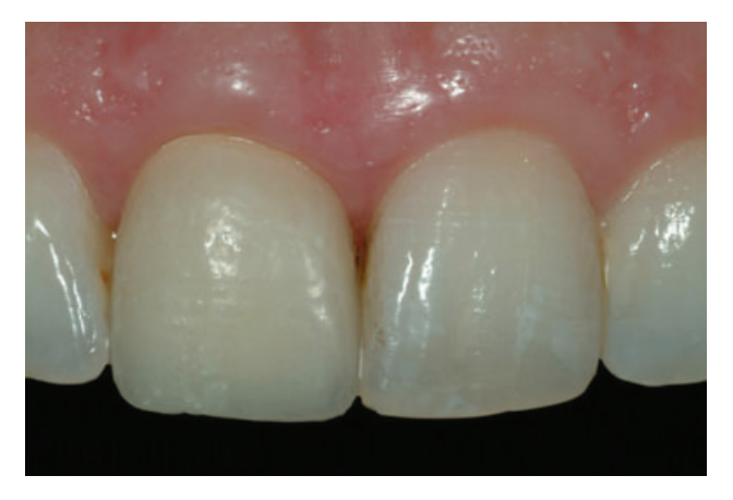
Figure 7. The provisional restoration generated of the diagnostic wax-up is placed to assess contours, surface texture and characterizations, soft-tissue integration, and shade.

characterization and the form of tooth to be matched, so it may serve as a reference for those variables. Digital images of the tooth prior to preparation as well as of the complete abutment are critical particularly if a decision is made to use an all-ceramic crown (Figures 5–7). Some materials are