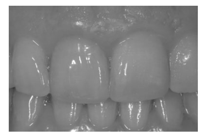
Figure 8. A frontal view of the completed restoration in the patient's mouth 2 years after cementation. Note the value of the restoration as related to the adjacent dentition.